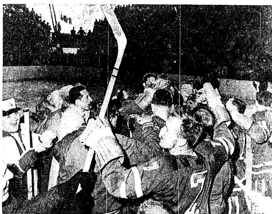
An explosion of emotion rocked the ice arena after U. S. beat Russia. Players and fans joined together in merriment as America reached a new plateau—needing a victory or tie against Czechoslovakia for first U. S. gold medal in hockey.